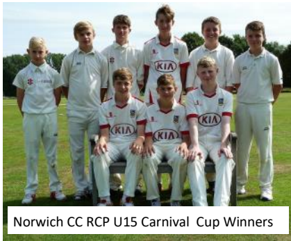
Norwich CC RCP U15 Carnival Cup Winners

W ith a record entry, the SNCL welcomed over sixty teams for its eleventh summer of youth cricket.